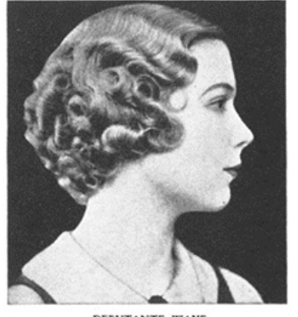
DEBUTANTE WAVE

http://my50syear.blogspot.com/2012 01 01 archive.html