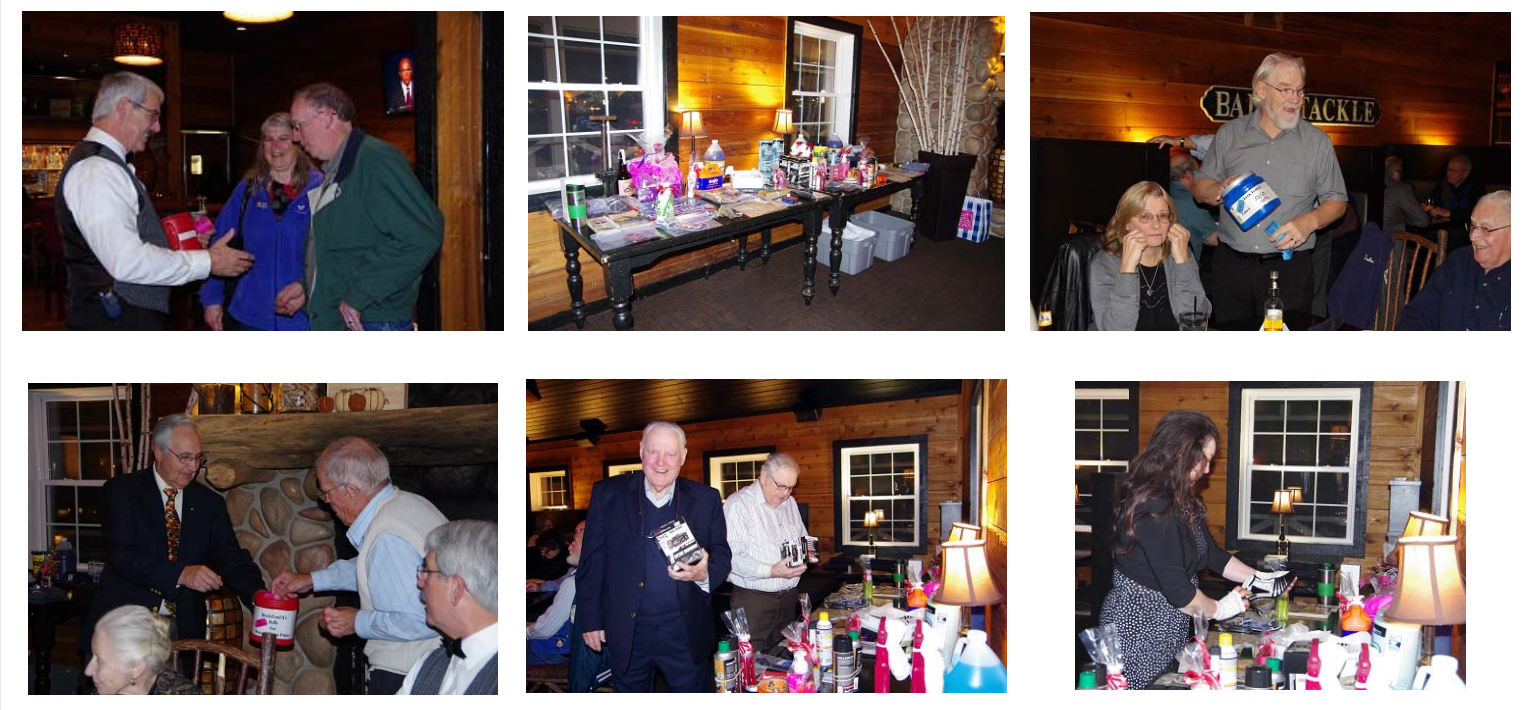
The Annual Fall Banquet welcomes new members, sponsors a 50/50 monetary raffle, door prizes and more ...

Food (and cars) are the "glue" which seems to hold this Club together! A banquet is a fitting to end another year of travels celebrating our love of this unique hobby and the friendships we have made along the way.