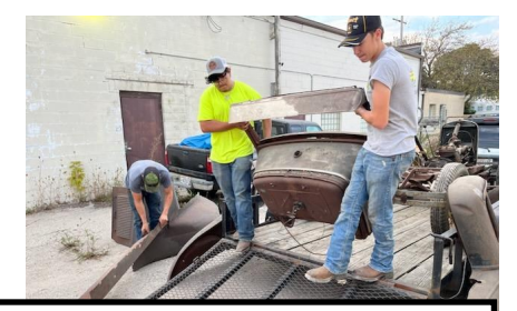
Body parts were bought & sold to add to the completed rolling chassis. Gotta love Face Book Marketplace!