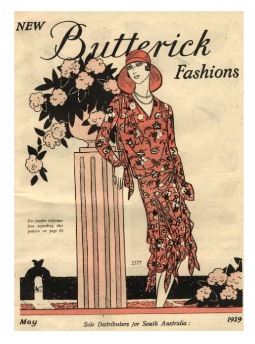
from Butterick Fashion News, May 1929

Fashions just before the end of the twenties - when hems fell, feminine curves came back into style, and modish women become "ladylike" once again. <u>http://www.100megspop3.com/adira/1920s.html</u>