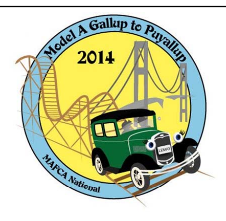
July 14 - 18, 2014

Be sure to give this code MDLA to get the Meet Rate