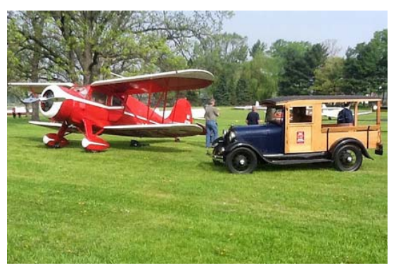
Wings and wheels share some space at the Beloit Airport