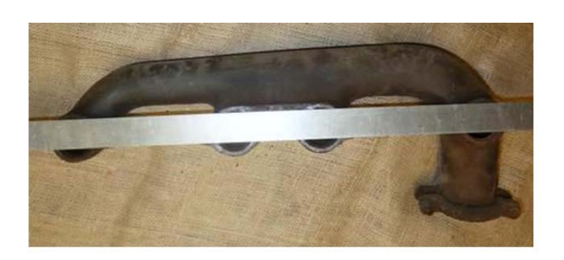
1931 exhaust manifold with the extra reinforcing rib on #4. Notice that there is no sag on #4. All 4 gaps on the top and bottom of the straight edge are the same.