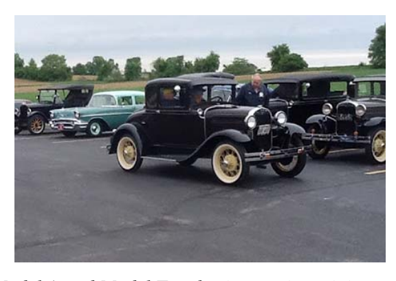
Model A and Model T enthusiasts enjoy a joint tour