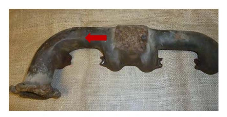
By March 1931 Ford had solved the problem. In the photo above, an extra reinforcing rib was added to #4 port as indicated by the arrow.

Solution: Order a new manifold from a parts supplier. It will be money well spent.