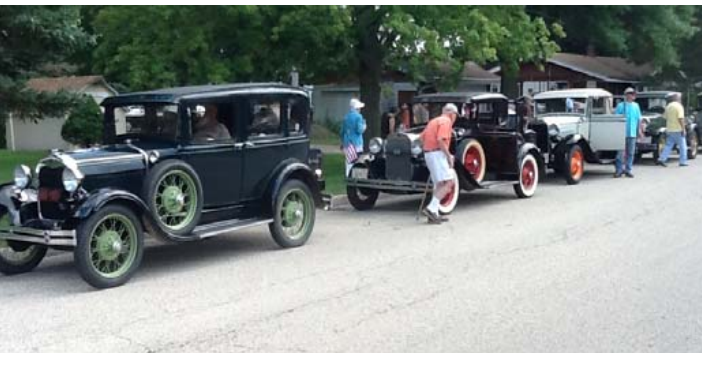
Waiting for the Byron parade to step off

A nice line-up of cars for the Mt. Morris parade!