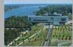
Clinton Presidential Library

For the 2014 MAFCA National Awards Banquet December 3-7, 2014