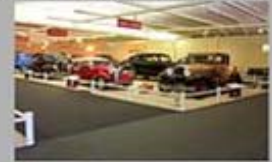
Museum of Automobiles