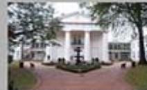
Old State House

Host Hotel: Holiday Inn Airport 3121 Bankhead Dr., Little Rock, AR 72206 - REGISTER EARLY