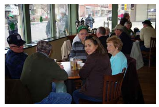
Warming up with friends and coffee at Katie's Cup Coffee Shop