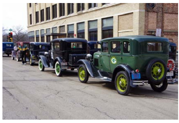
Ready to step off before the parade