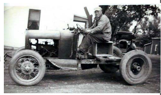
Doodle Bug before a seat was installed; photo taken during a test run; notice spot light.

At that time, they farmed with horses and a 1925 McCormick Deering 10-20 on steel tractor. Dad decided to convert the Model A to a light duty tractor. The body was removed with only the cowl remaining. The rear wheels and drive train from the transmission back were removed and replaced by transmission, differential, wheels and tires from a big Packard. That combination gave many choices of speed or power. With chains on the rear wheels, it could pull a pretty big load. I officially learned to drive in a '37 Dodge but I learned more than that in that "Doodle Bug". I learned to make it stop and go as only a young boy in an open field could do. As modern tractors came to the farm, the Doodle Bug gradually went into retirement. It was finally sold for parts. I can't help but wonder if some cars on the road today might have some small part from our Doodle Bug keeping them going strong.