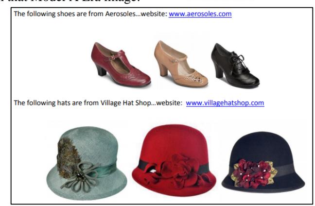
Good luck and I hope this will entice you to start enjoying the Model A "look"!

http://www.mafca.com/downloads/Fashions/Articles/Getting Started 2015-03.pdf