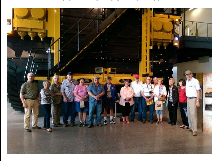
Rock-Ford A's and friends from the Central Illinois A's at the Caterpillar Visitor Center, in Peoria, Illinois