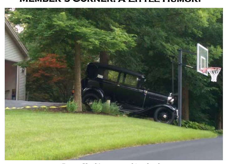
Dave Clark's new parking brake